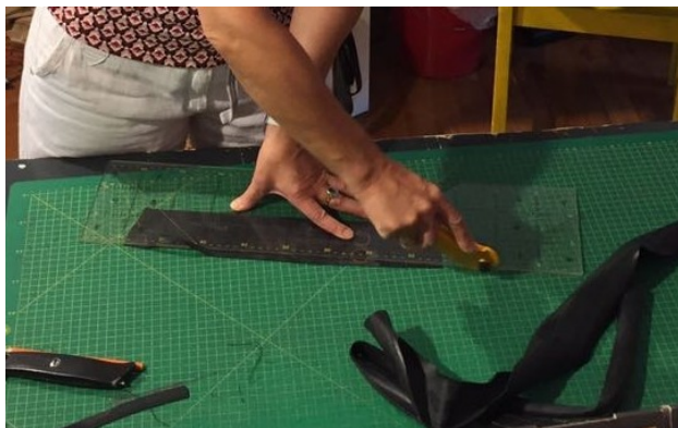
Brigitte the owner of sine at work cutting and sewing used bicycle tubes.

Sine uses old bicycle tubes which it gets from bike stores to make new and stylish products from them.