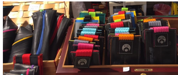
Finished products (pencil cases, phone cases, pouches,...)

4th Step: Adding a colourful zip onto the product